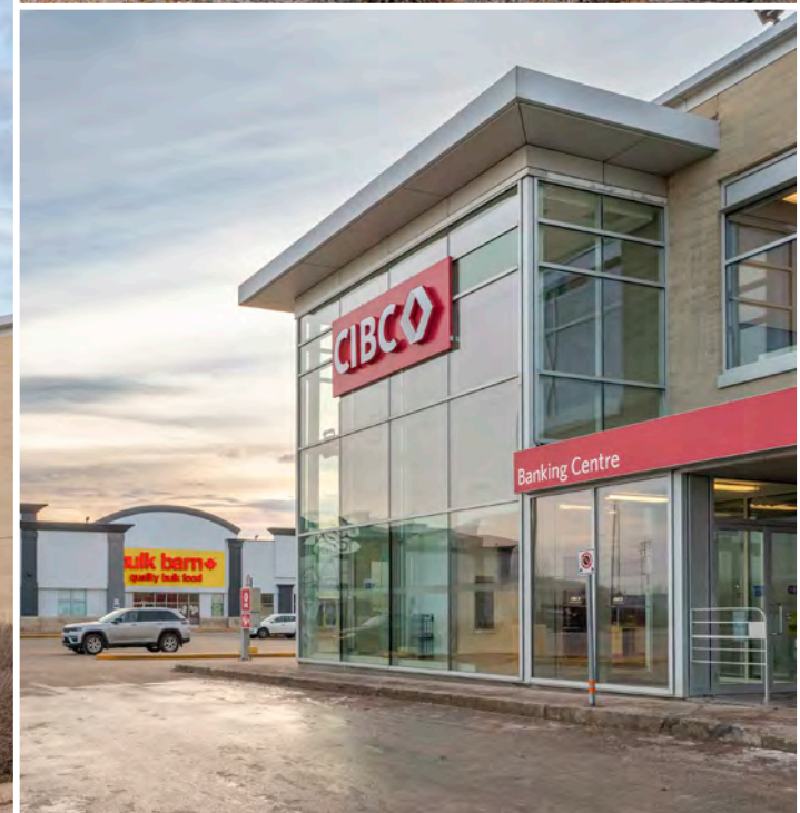
Essential Service Retail Tenants