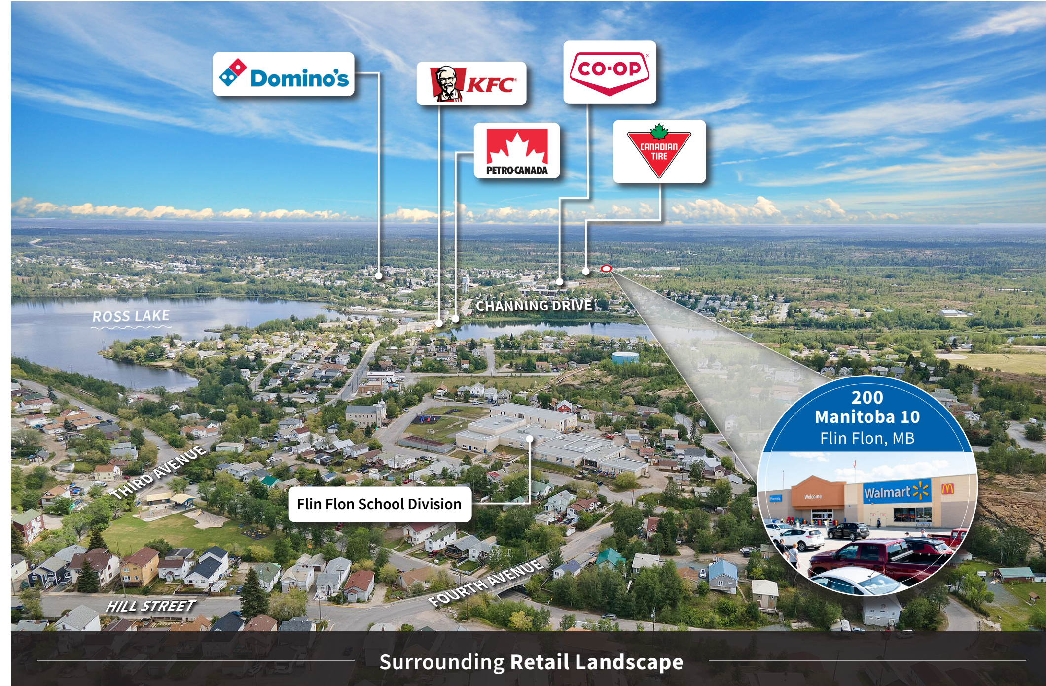
Surrounding Retail Landscape